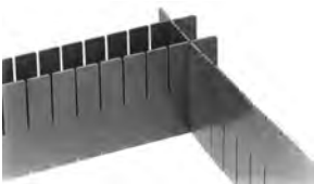
tote box dividers