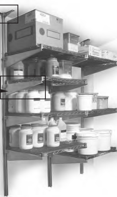
wall-mounted cantilevered shelving shown with wire shelving