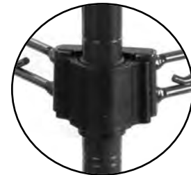
Quad-Adjust® Collar - allows the addition or removable of a shelf without having to disassemble the entire shelf unit.